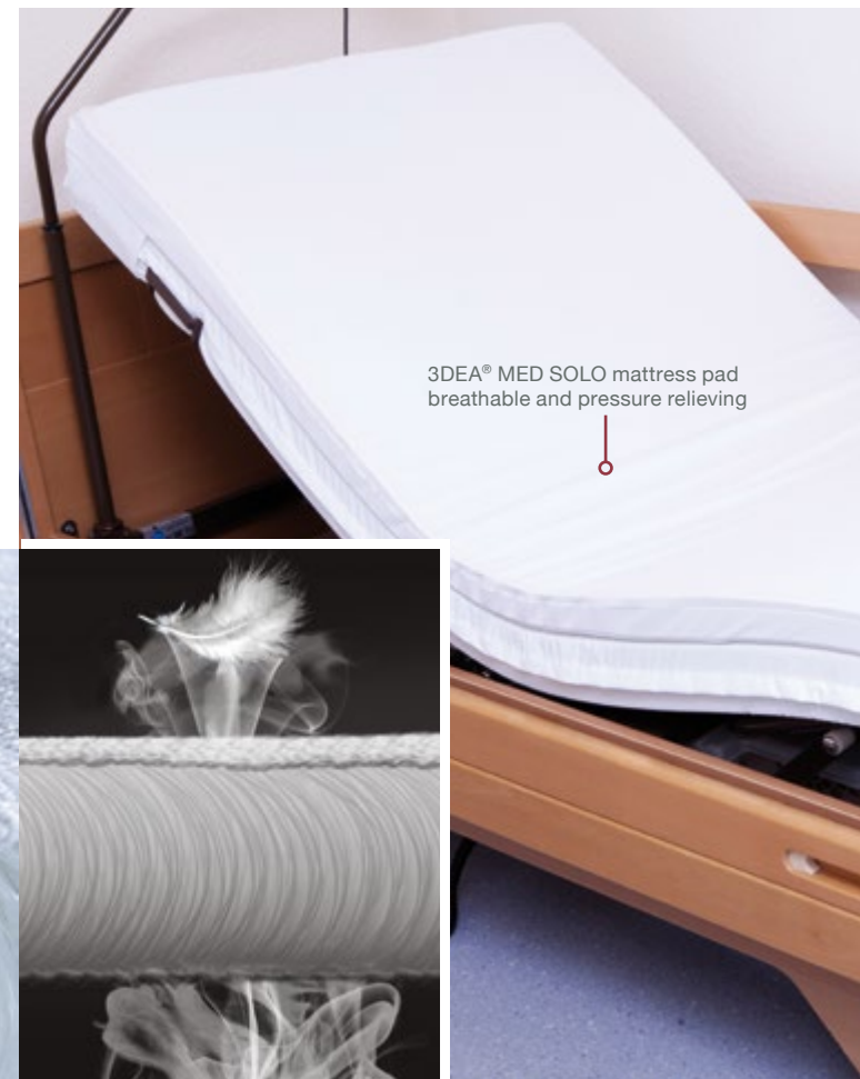
3DEA® MED SOLO mattress pad breathable and pressure relieving

– also for decubitus prophylaxis and therapy