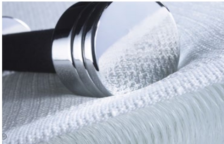
Pressure relieving: 3DEA® spacer fabric