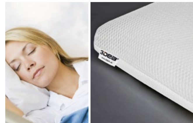
3DEA® MED pillow