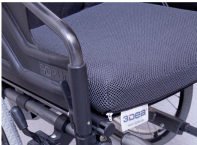
3DEA® wheelchair seat cushion