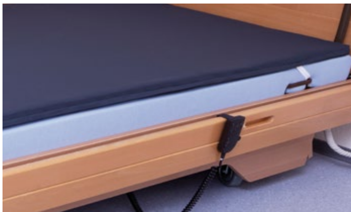
3DEA® CARE SOLO mattress pad